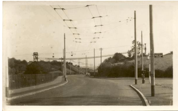
The bucket conveyor of S. and E. Collier, brick, tile and pottery manufacturers, which carried clay over Norcot Road, Tilehurst, Reading, c. 1940