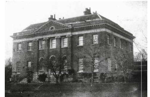
Calcot Park, Bath Road, Tilehurst, c. 1845.