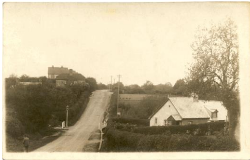
Chapel Hill, Tilehurst, Reading, looking north-westwards, c. 1935.