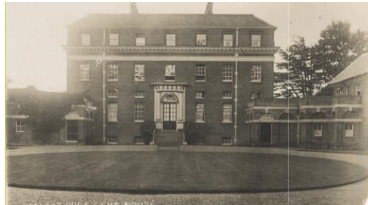
Calcot Park Golf Club House, c. 1935.