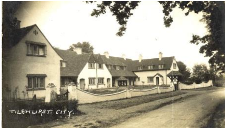
"New Cottages," City Road, Tilehurst, Reading, c. 1935