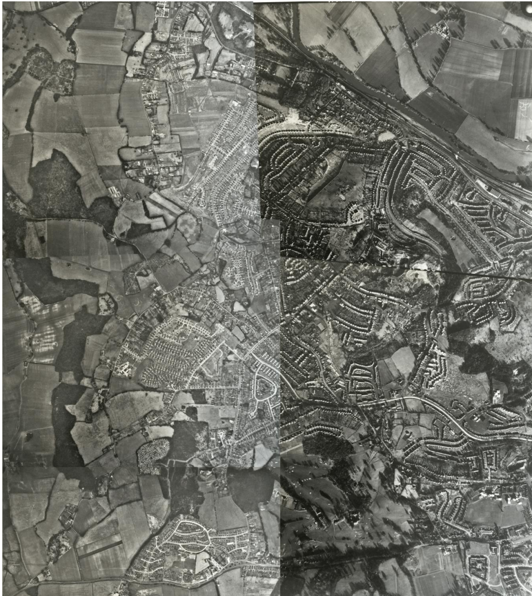
Aerial photo of Tilehurst (1964)