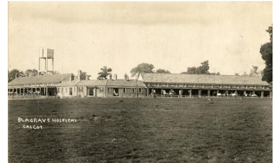
Blagrove Hospital, Langley Hill, Tilehurst, Reading, from the south, c. 1935. The buildings have verandahs' with patients in beds under them.